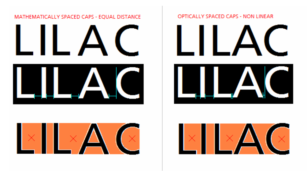
Figure 4: The samples on the left are spaced with an equal amount of horizontal distance between each letter. The samples on the right are adjusted by a typographer to have an apparent equal amount of space between each letter.

Type design and setting is an artistic enterprise with the goal of creating a beautiful page of text. While it was surprising that there were no performance differences in the page setting study, it was astonishing that there were no preference differences in the OpenType study. The features that are part of OpenType are considered essential to typographers and are generally believed to improve the aesthetics of the page. The participants generally agreed that the OpenType features were beneficial after they were pointed out. It would be beneficial to have a methodology that can detect typographic improvements without first drawing attention to the differences.